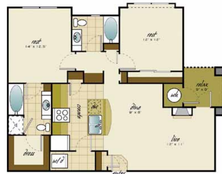
BISCAYNE • 1,143 Sq. Ft. 2 Bedroom / 2 Bath