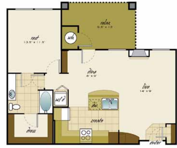
BLUESTONE • 778 Sq. Ft. 1 Bedroom / 1 Bath