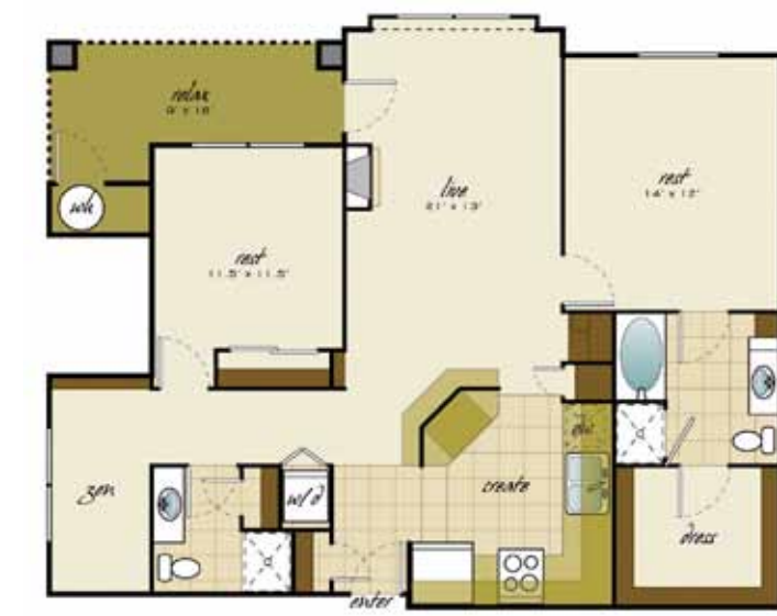
TALLGRASS • 1,170 Sq. Ft. 2 Bedroom / 2 Bath + Study