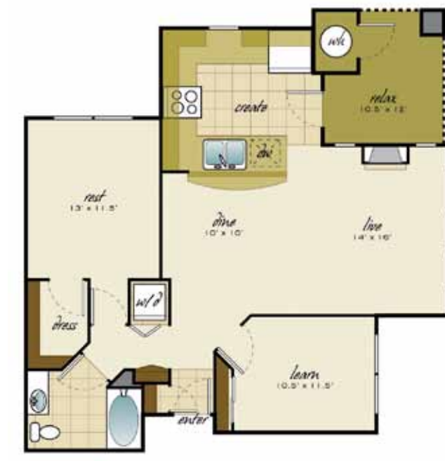
ESSEX • 967 Sq. Ft. 1 Bedroom / 1 Bath + Study