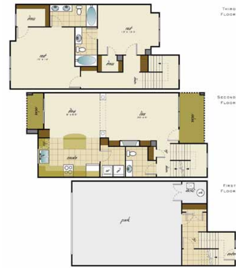
BANDELIER • 1,523 Sq. Ft. 2 Bedroom / 2 1/2 Bath