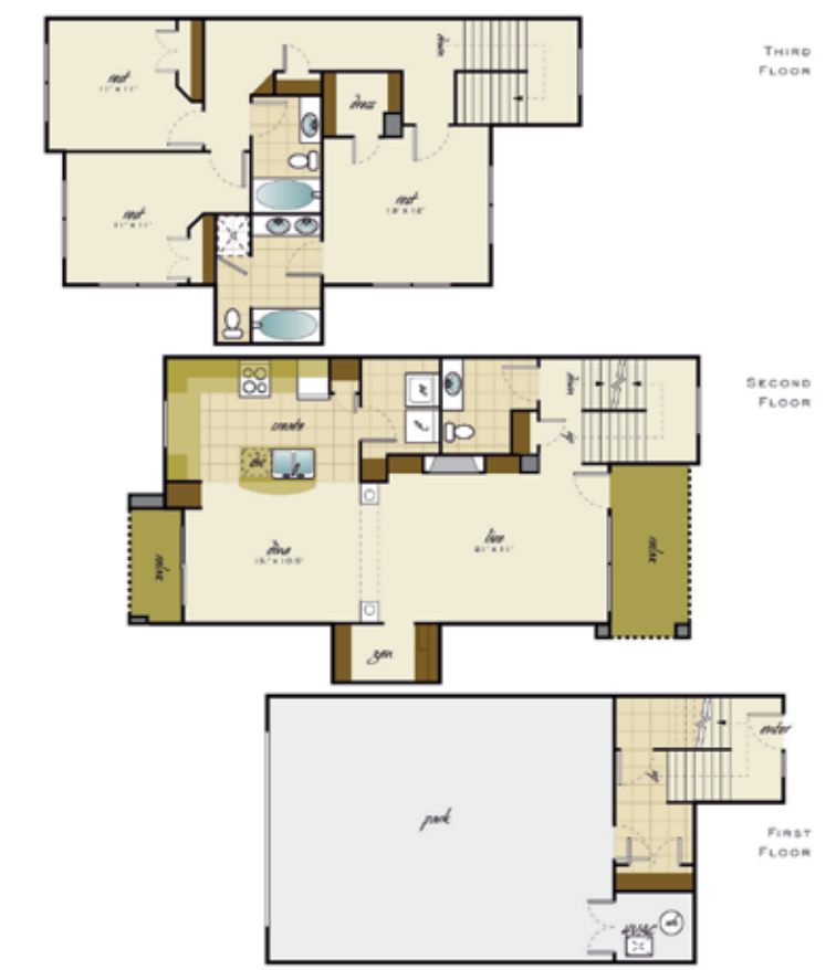
OZARK • 1,737 Sq. Ft. 3 Bedroom / 2 1/2 Bath