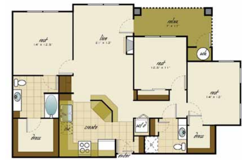
YOSEMITE • 1,298 Sq. Ft. 3 Bedroom / 2 Bath