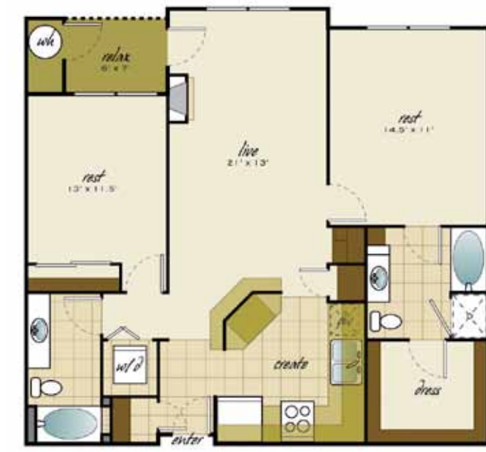
DENALI • 1,098 Sq. Ft. 2 Bedroom / 2 Bath